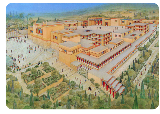
Reconstruction of the palace of Knossos

The Minoan civilisation existed between c3000 BC and c1100 BC on the Greek island of Crete. At the civilisation's peak, around 10,000 people lived in 90 cities. As Europe's first developed civilisation, the Minoans lived in towns with roads, wells and a basic sewerage system. They