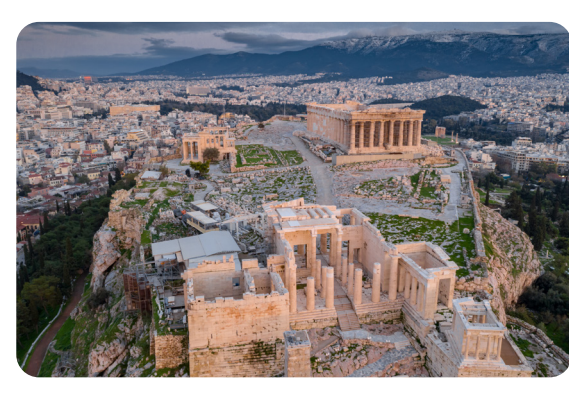
Aerial view of the Acropolis

The Classical period started in c500 BC and ended in 323 BC. It is known as the golden age of ancient Greece because many discoveries and advancements were made. People in the Classical period believed in gods and mythology from earlier periods,